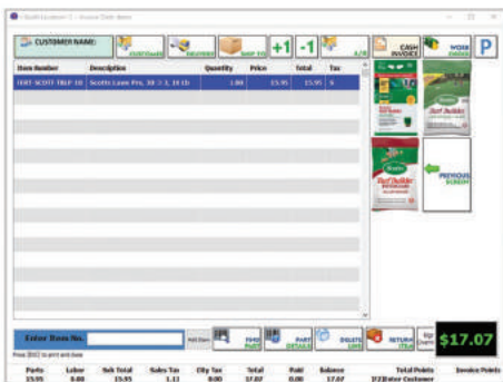
QUICK SALE SCREEN