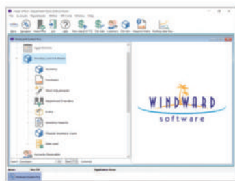
MOBILE RANGE SCHEDULING