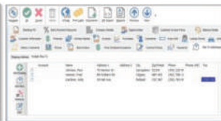
SHIPPING LABELS & DATES