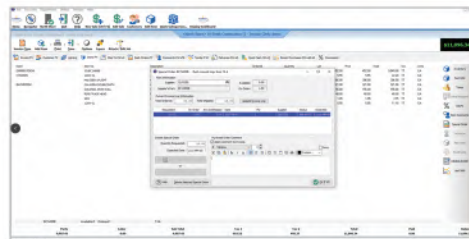
SPECIAL ORDER TRACKING